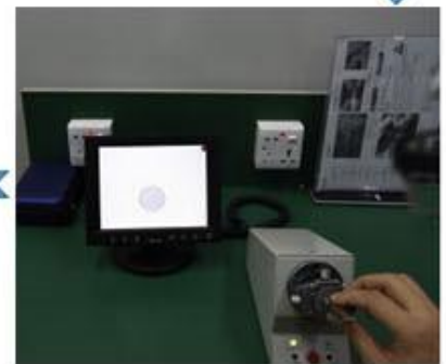
Cleaning end face