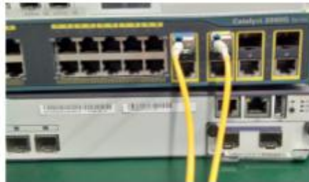
Cisco Catalyst 2960G