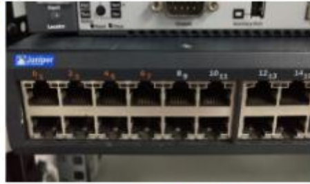
Juniper EX 4200