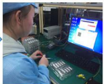
Product Final Test