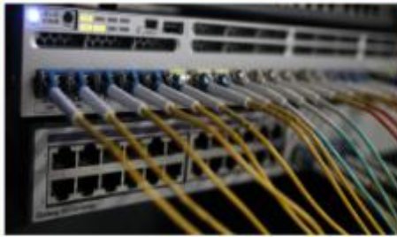
Cisco Catalyst 3850