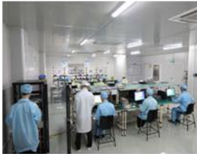
Standardized Production Line

Continuous introduction of new equipment, produced by strict standards, strict quality inspection, to guarantee the high quality standard of each product.