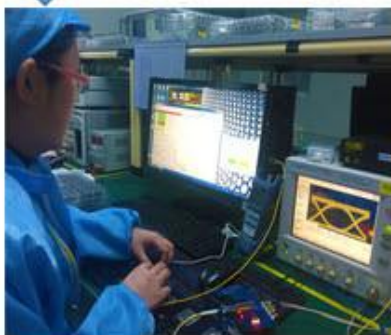
Product Initial Test