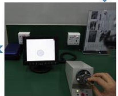
Cleaning end face