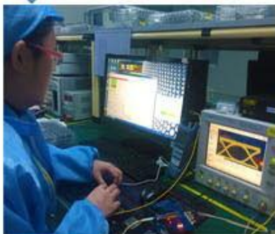
Product Initial Test