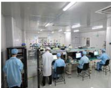
Standardized Production Line

Continuous introduction of new equipment, produced by strict standards, strict quality inspection, to guarantee the high quality standard of each product.