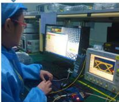
Product Initial Test