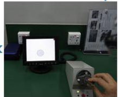
Cleaning end face